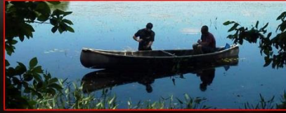
The producers film on Lake Nippenicket