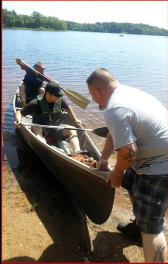
The producers set out to film on Lake Nippenicket