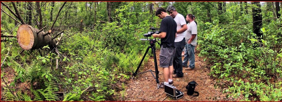
The producers shoot in a swamp in Raynham