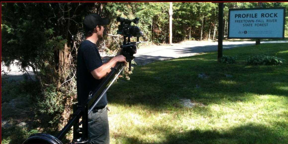
The producers shoot at Profile Rock in the Freetown-Fall River State Forest